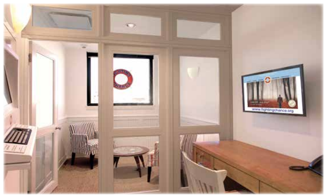
Suite 102, The Fighting Chance Office at The Phillips Center

The Patient Counseling Office for Fighting Chance also is located on Level 1, down the hallway from Radiation Oncology. The technical term for the services provided is Psycho-Oncology which aims to help patients cope with the many psychological and emotional challenges of a cancer diagnosis. They include a profound sense of disorientation, paralyzing fear, hyper-anxiety, sleeplessness and depression.