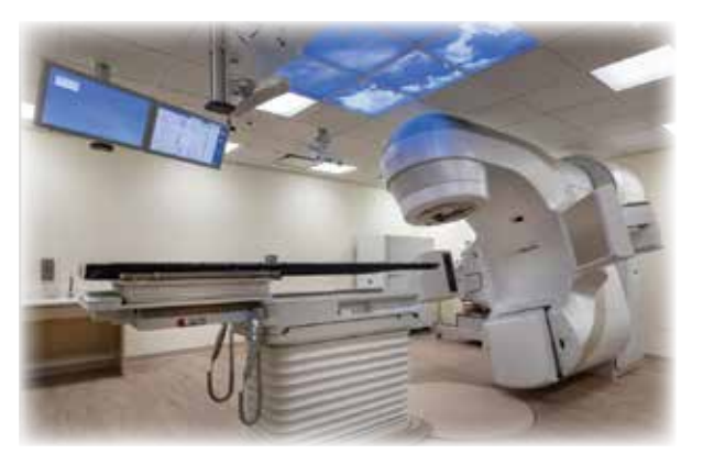
Radiation Treatment Center at Phillips