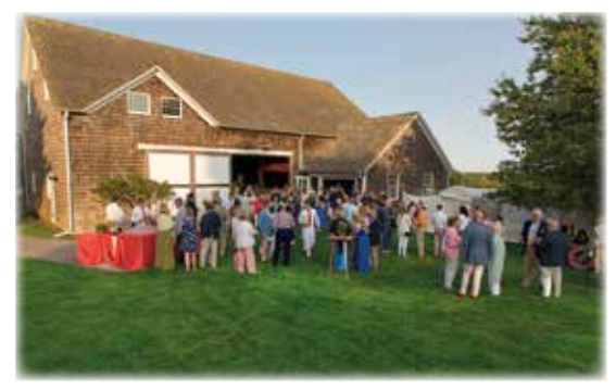
Cocktails on the Lawn