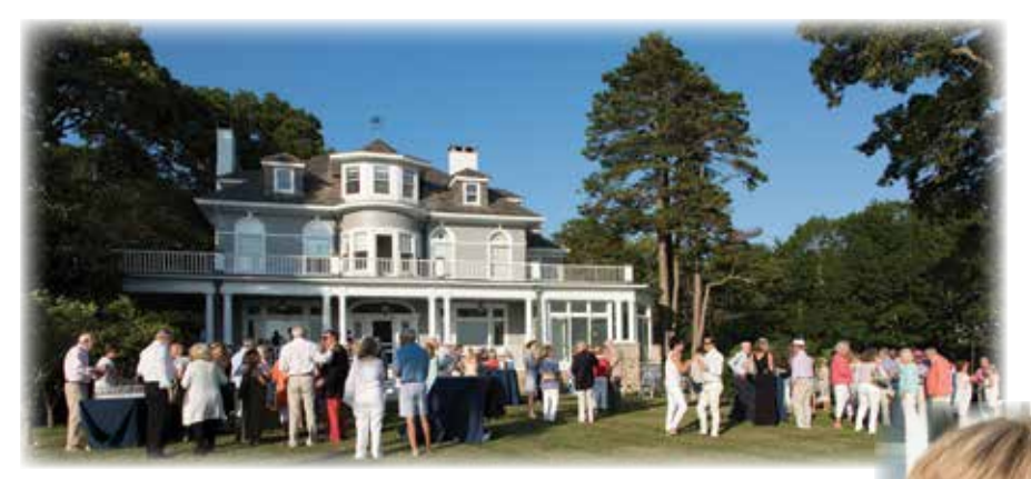
Guests gather on the lawn of the Ressler House in Dering Harbor