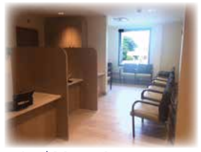
Level 1 Patient Registration

The dominant feature of Level 2 is a massive Chemo Suite with 14 infusion stations. Before progressing to the Chemo Suite the first stop is a Patient Registration & Waiting Area.