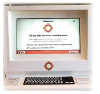
Patient Appointment Kiosk.

The Patient Counseling Office for Fighting Chance also is located on Level 1, down the hallway from Radiation Oncology. The technical term for the services provided is Psycho-Oncology which aims to help patients cope with the many psychological and emotional challenges of a cancer diagnosis. They include a profound sense of disorientation, paralyzing fear, hyper-anxiety, sleeplessness and depression.