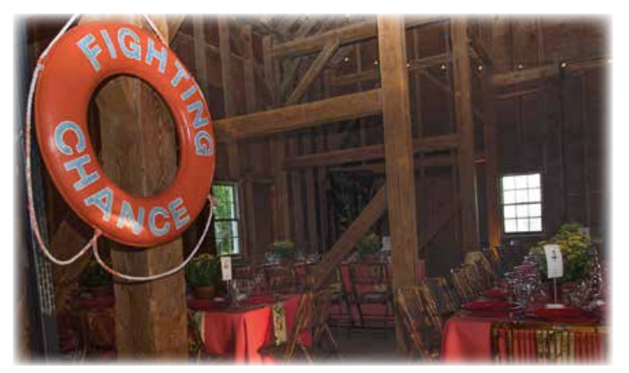
The Barn welcomes 180 guests for farm-to-table dinner