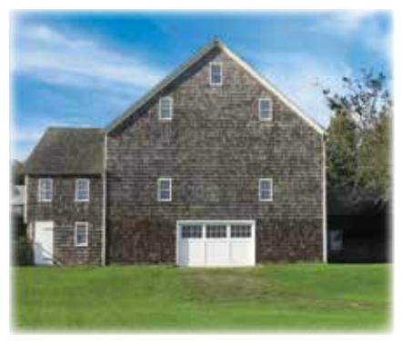
Wesnofske Barn on Scuttlehole Rd