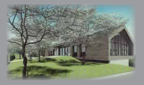
Architect's depiction of the New Cancer Center Southampton, NY