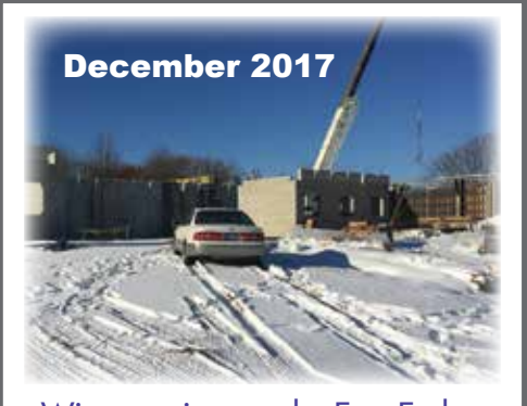
Winter arrives on the East End . . but construction continues