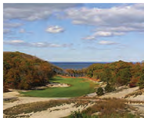
Friar's Head (The Hamptons)