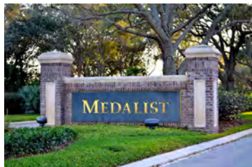
Medalist GC Hobe Sound, FL (Home course for Tiger Woods, Ricky Fowler & Dustin Johnson)