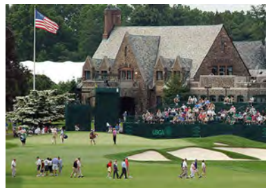
Winged Foot (Westchester, NY)