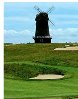
The National (Southampton, NY)