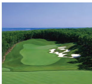
The Bridge (Bridgehampton, NY)