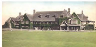
Maidstone (East Hampton, NY)