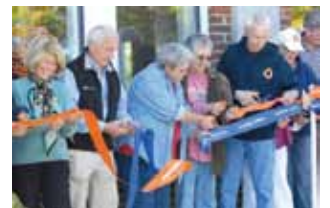
3rd Office 2011 to 2021 (lease renewal date) #34 Bay Street on the Village Waterfront