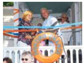
2nd Office 2006 – 2010 Renovated Victorian at Jermain St. & Rt.114