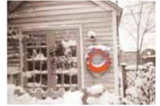
1st Office 2002– 2005 Converted Garage on a Village Alleyway