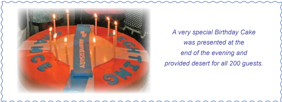
A very special Birthday Cake was presented at the end of the evening and provided desert for all 200 guests.