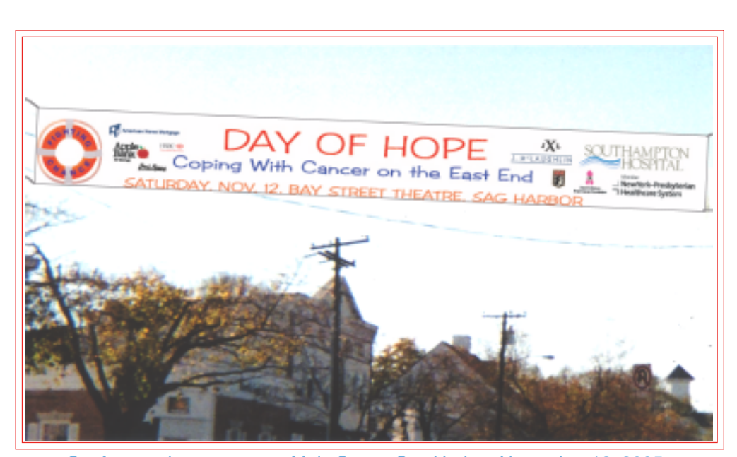
Conference banner across Main Street, Sag Harbor, November 12, 2005

KeynoteSpeakers are Nationally Acclaimed Oncologists