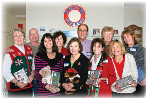
Our wonderful, dedicated volunteers at the FC annual Christmas Party at our office