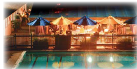
Summer Gala 2009 at Maidstone Beach Club