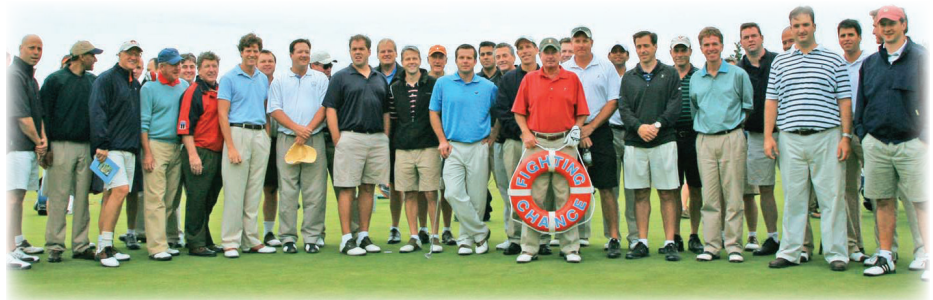
Golf Tourney at Friars Head Golf Club