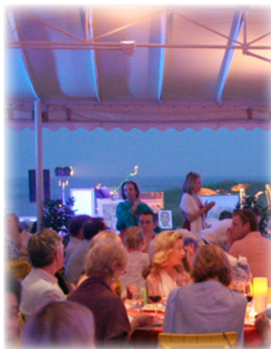
Summer Gala 2011 at Maidstone Beach Club