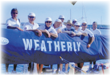
“Crew Fighting Chance” about to enter a Charity Yacht Race