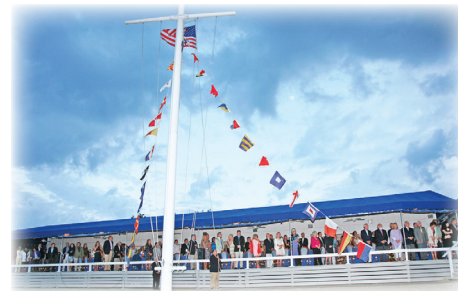
Summer Gala 2012 at Devon Yacht Club