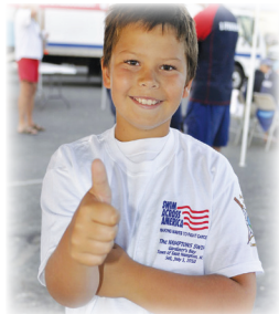
Youngster at Amagansett Charity Swim