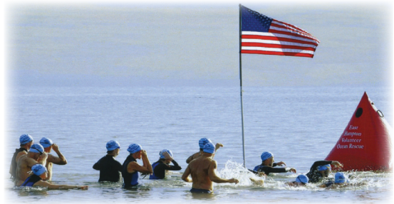
Swim Across America Event in Amagansett to Benefit Fighting Chance