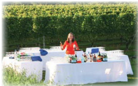
Summer Gala 2010 at Wölffer Vineyards