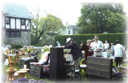
Our First Yard Sale in 2004 at St. Luke's Church in East Hampton