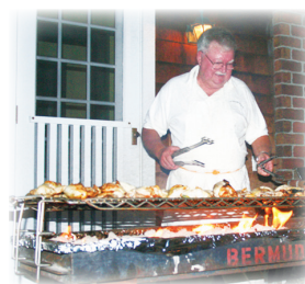
Grill master at Charity BBQ