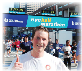
“Team Fighting Chance” Runs NYC Half Marathon