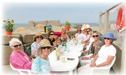
1st Annual Lobster Bash held at Duryea's in Montauk. Pictured here, ladies enjoying the great food and scenery