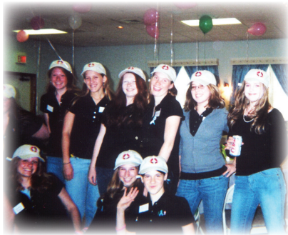
Hosts for Spaghetti Dinner