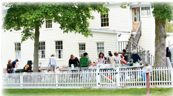
Yard Sale outside our former office on Hampton Street, in 2007