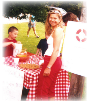
Mom & Kids Hosting our Lemonade Stand