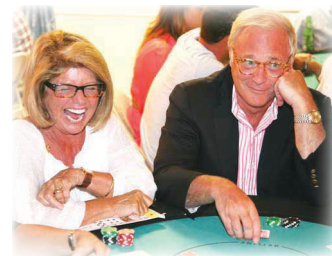
One Happy Winner at our First Annual Poker Championship