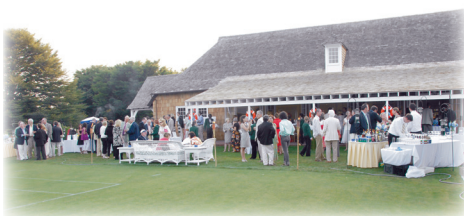
Summer Gala 2008 at Maidstone Tennis House