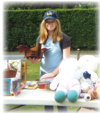
Student Running a Yard Sale Table