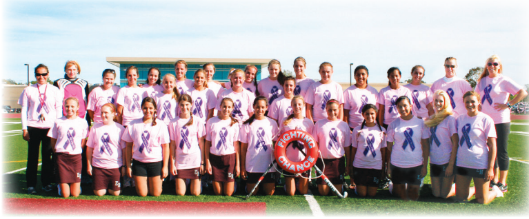
East Hampton High School's Girls Field Hockey Team which has raised money for Fighting Chance for the last two years